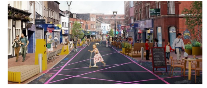
Long term vision ideas